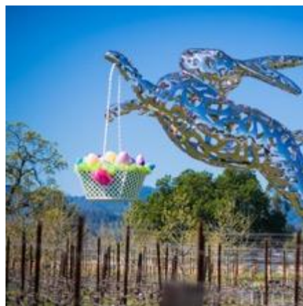
The Easter bunny at Hall St. Helena

You can find a list of restaurants that are open at the Visit Napa Valley website, www.visitnapavalley.com .